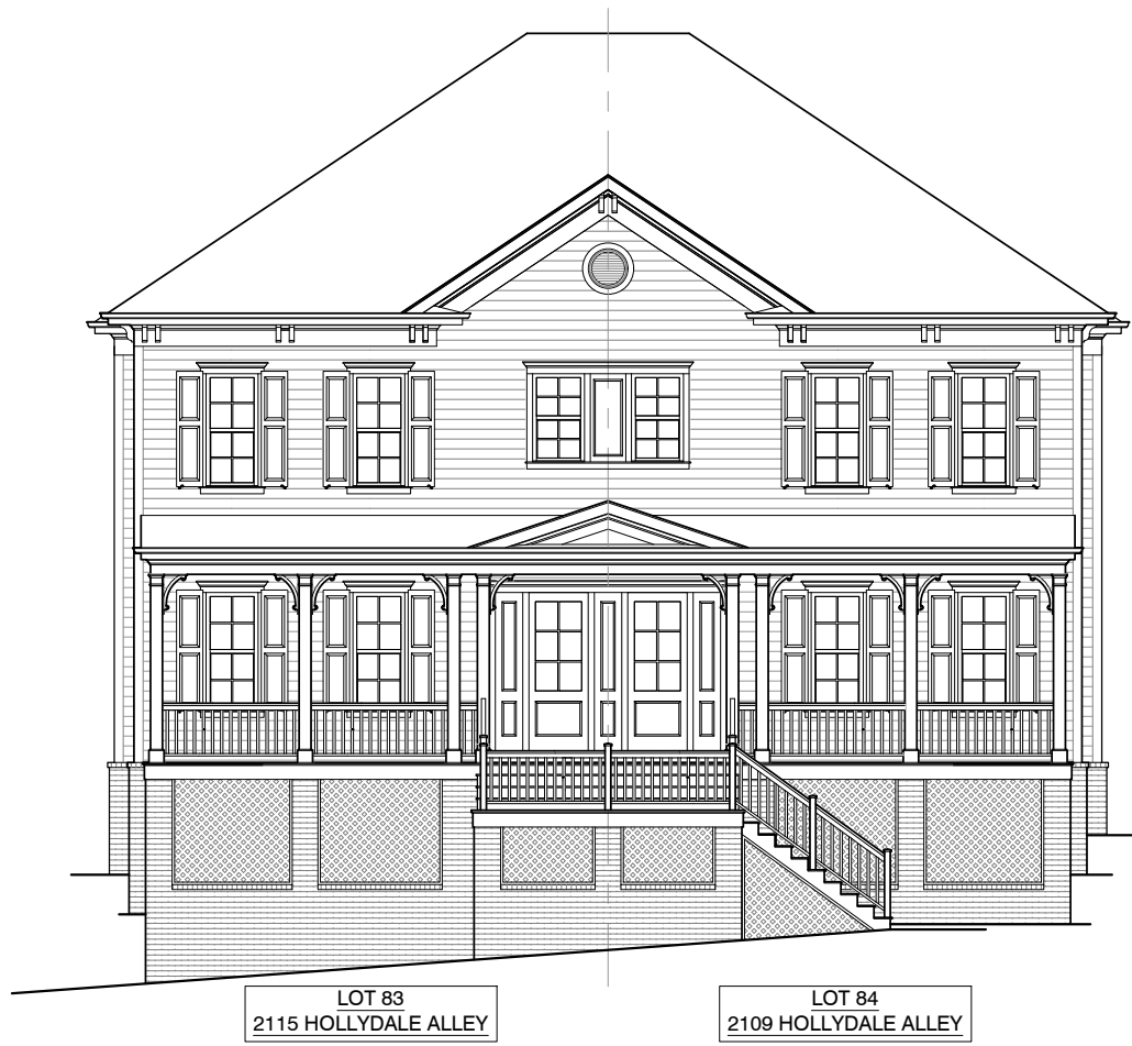
1 FRONT ELEVATION 3/16" = 1'-0"