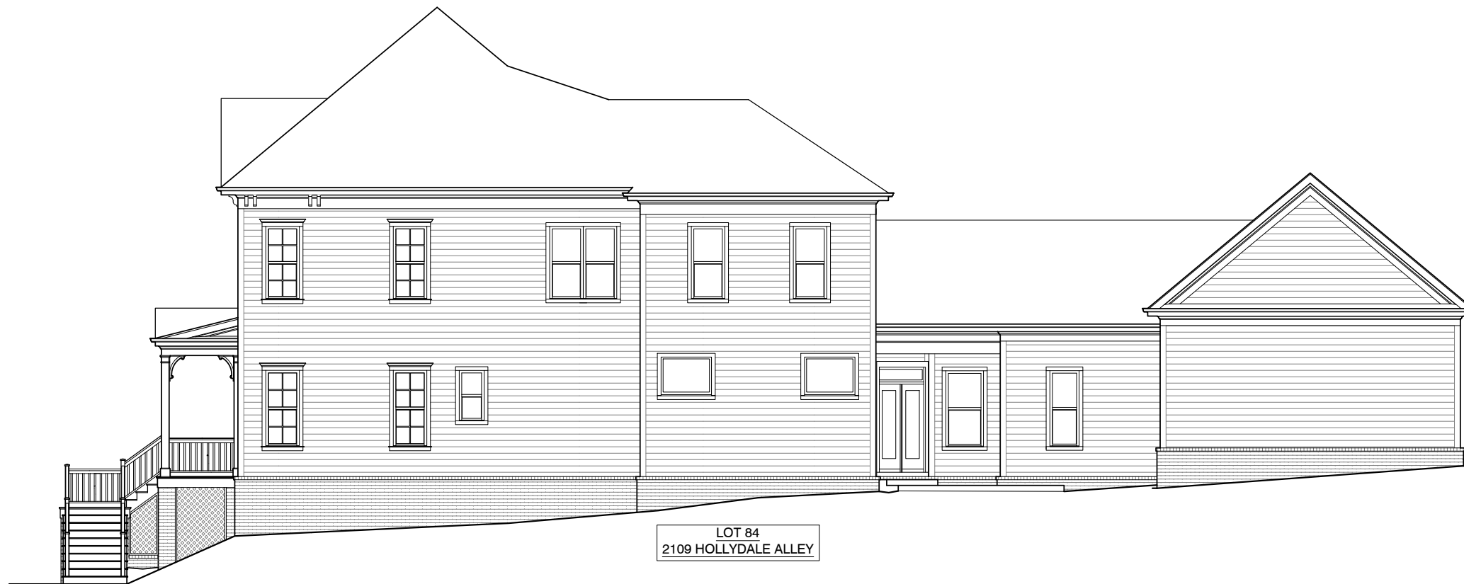
1 RIGHT ELEVATION 3/16" = 1'-0"