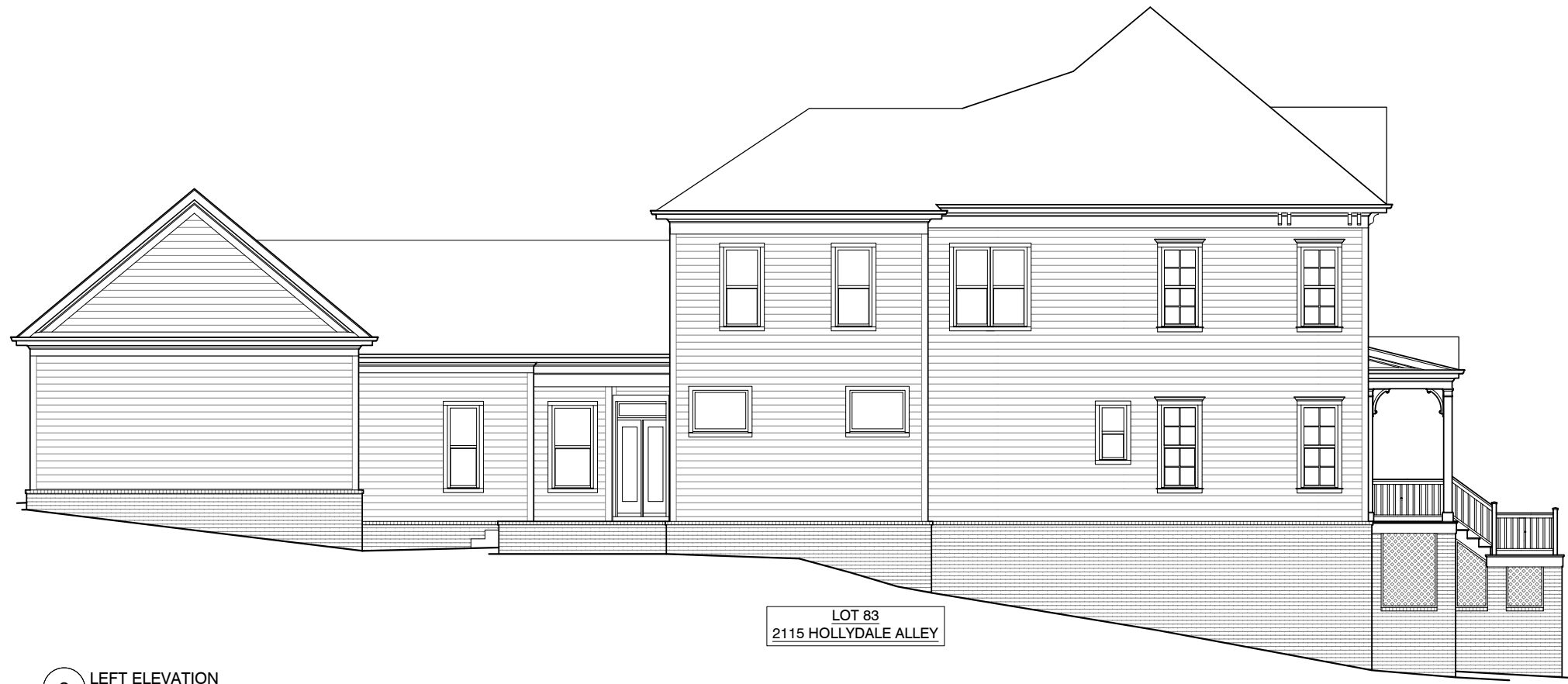
2 LEFT ELEVATION 3/16" = 1'-0"