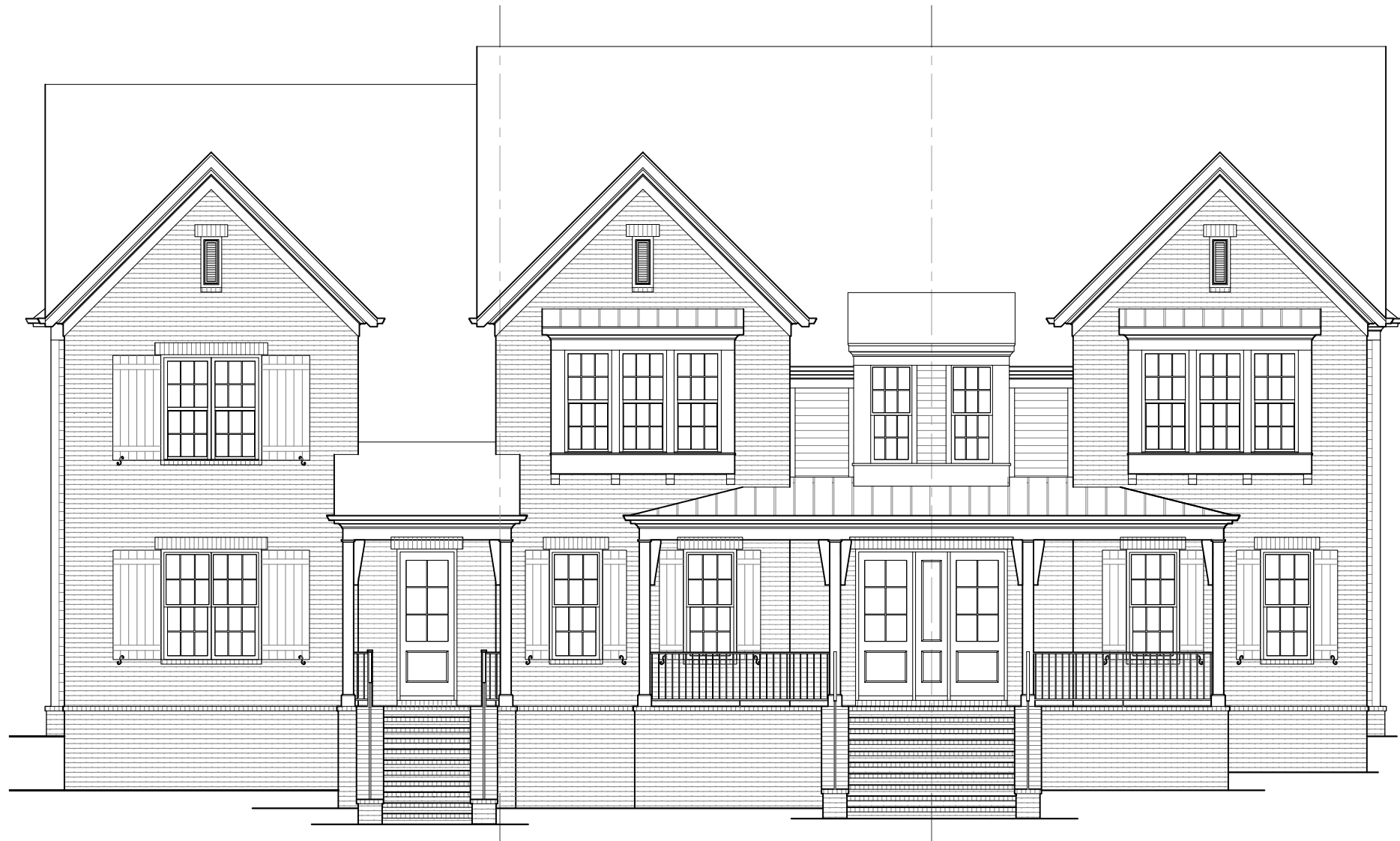
1 FRONT ELEVATION 1/8" = 1'-0"