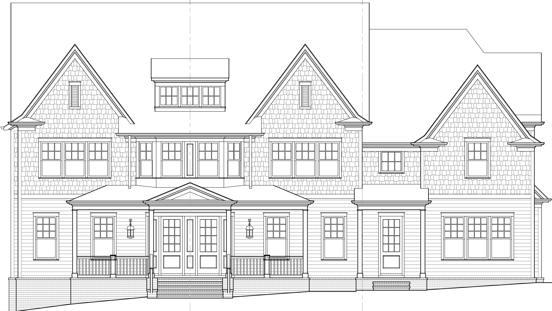
1 FRONT ELEVATION 1/8" = 1'-0"