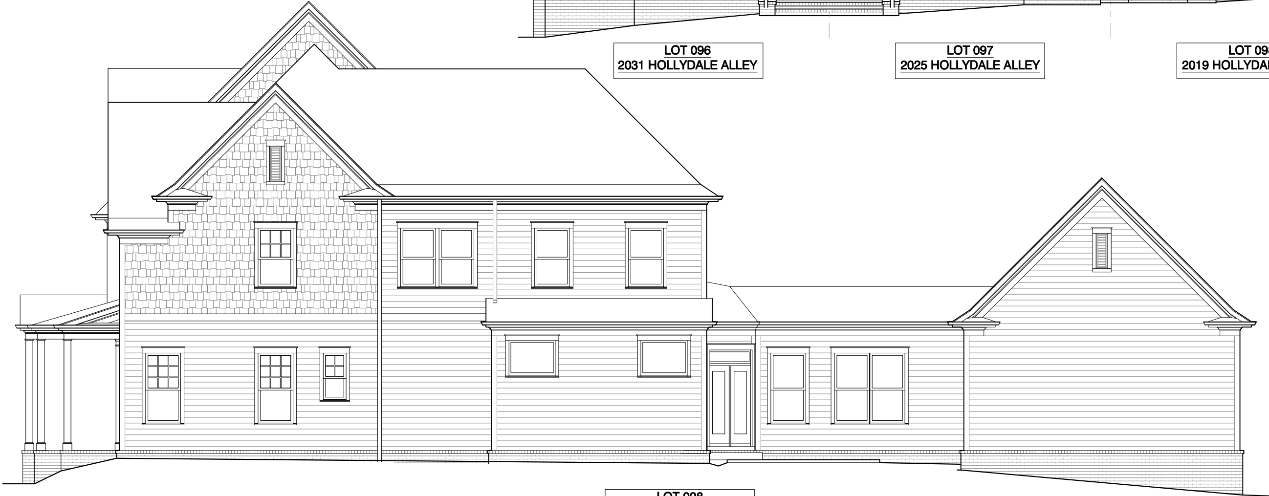
2 RIGHT ELEVATION 1/8" = 1'-0"